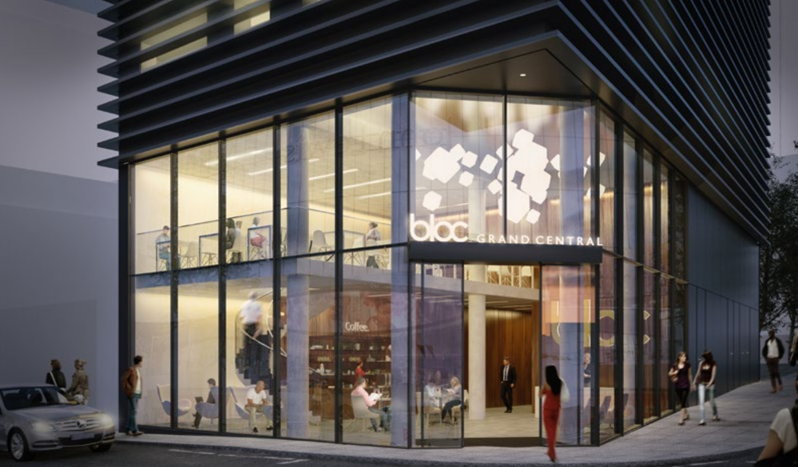
BLOC GRAND CENTRAL RECEPTION